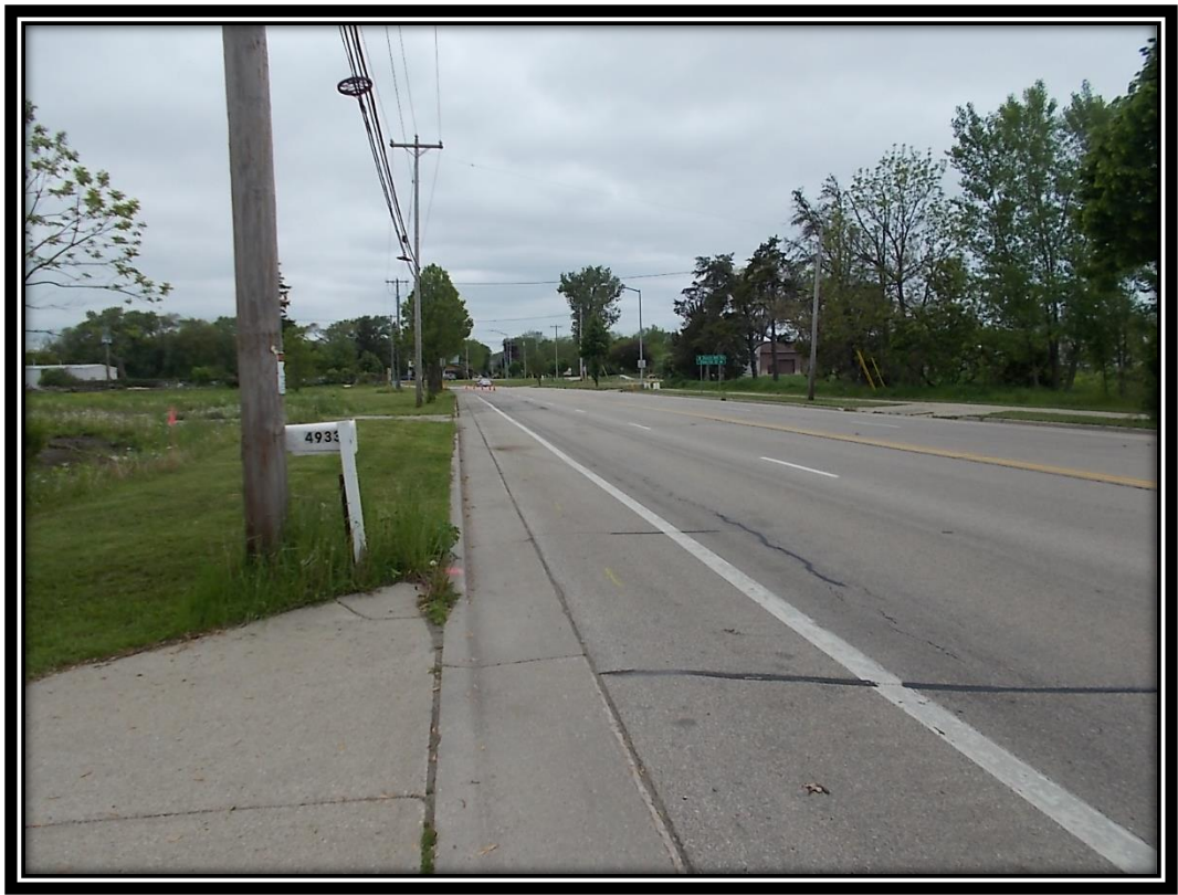
FACING WEST ON FEMRITE DRIVE