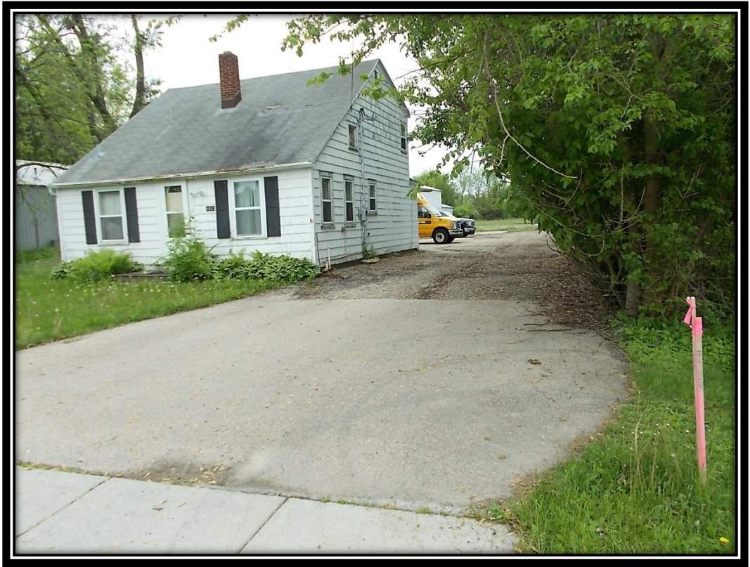
FACING SOUTH @ NORTHWEST PROPERTY CORNER