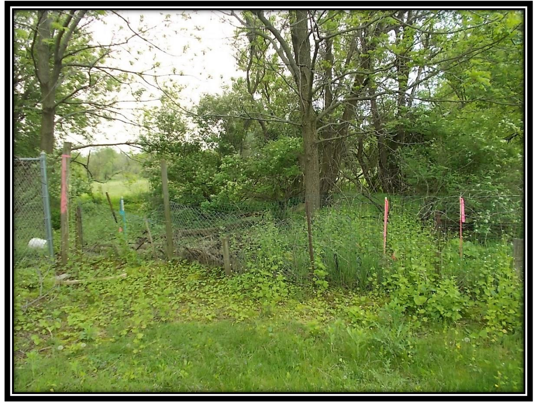
STAKES @ SOUTH END OF PROPERTY