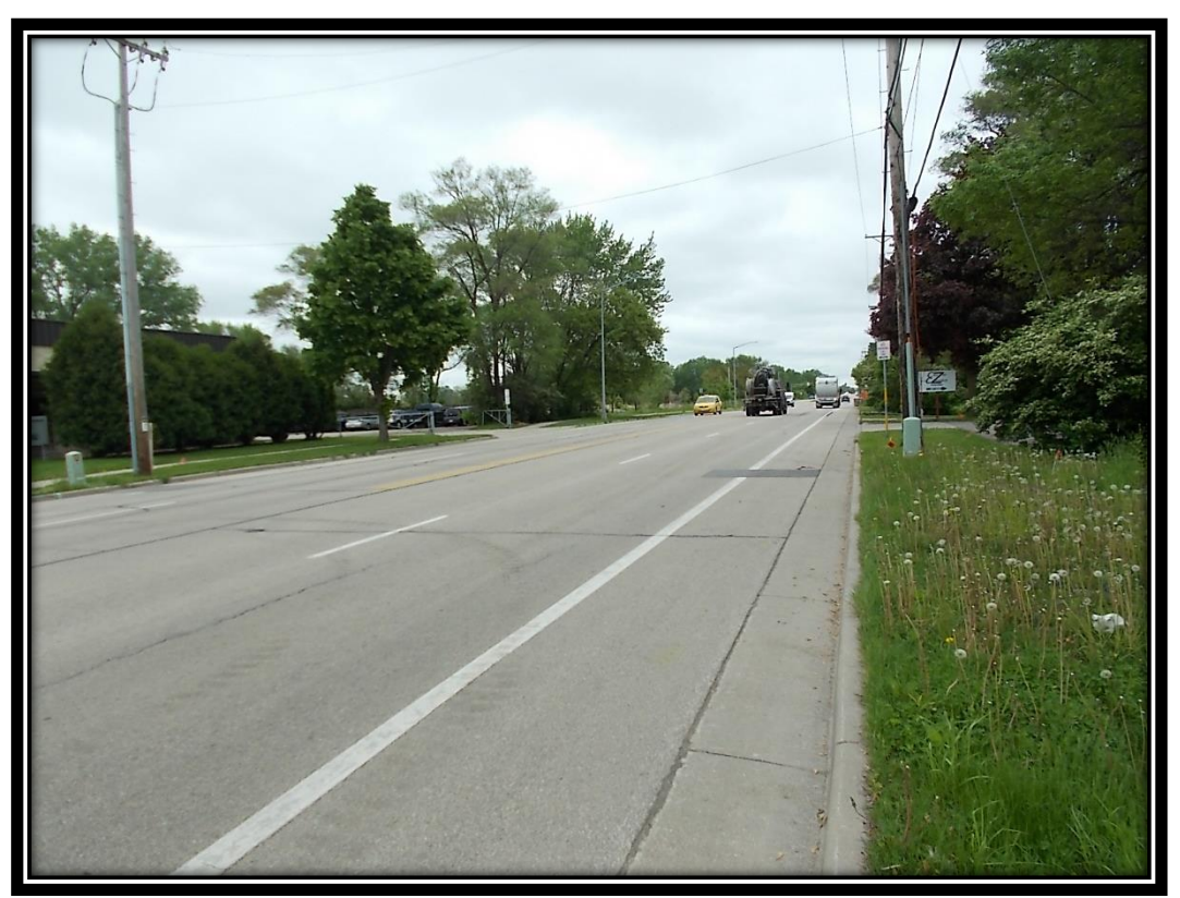
FACING EAST ON FEMRITE DRIVE