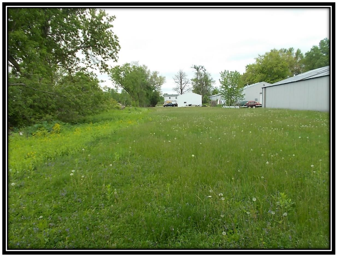
VIEW FROM SOUTH END OF PROPERTY