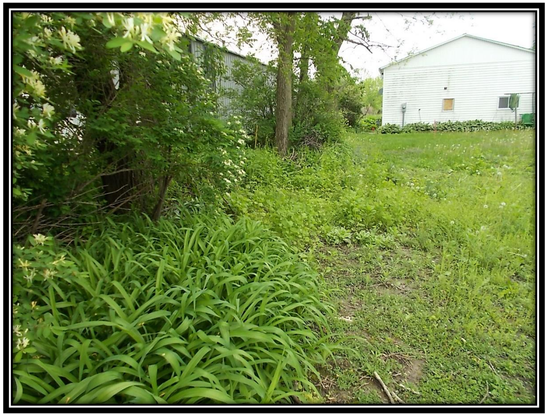
FACING SOUTH @ NORTH END OF TLE