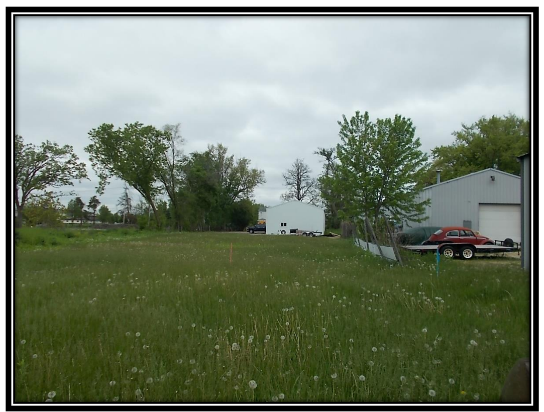
FACING NORTH @ SOUTH END OF TLE