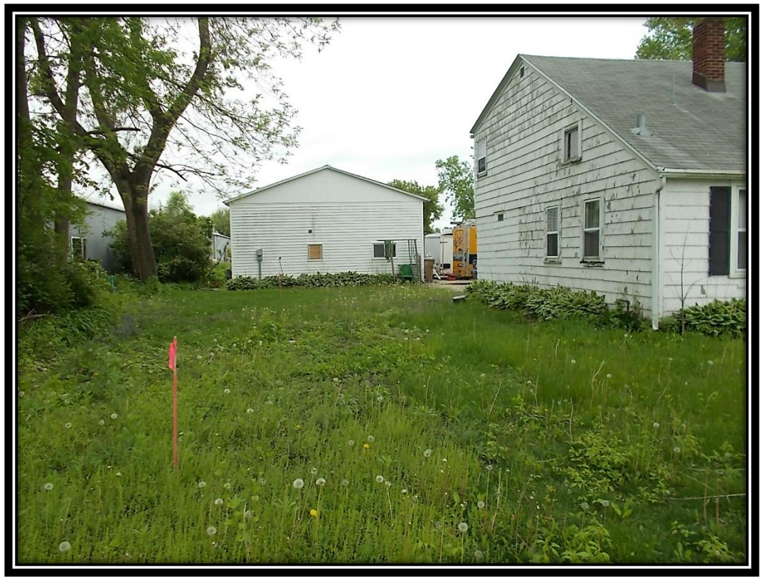
FACING SOUTH @ NORTHEAST FEE STAKE